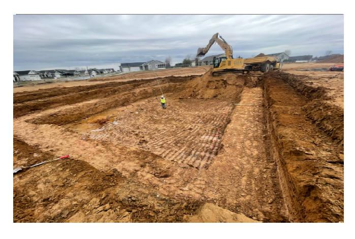
Pool equipment building excavation