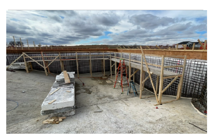
Lap pool wall rebar