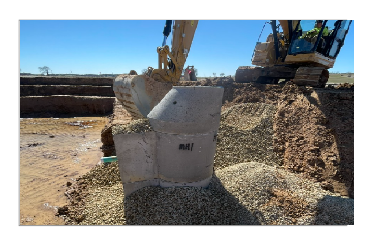
Sanitary structure installed at equipment building