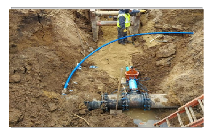
Water lateral tie in on East side