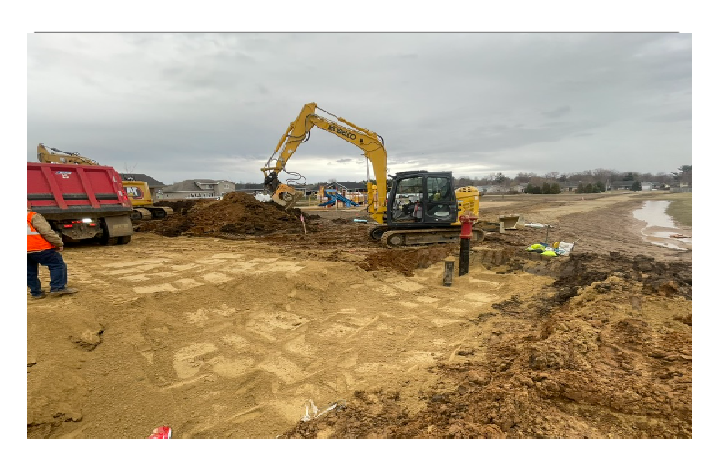
Water main and hydrant installed on East side of park